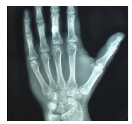
Figure 2: Osteopoikilotic lesions on the hand

objectified lumbar spinal stenosis. Computed tomography of the ankles has objective sclerotic foci in the tibia and calcaneum of variable size (Figure 3).