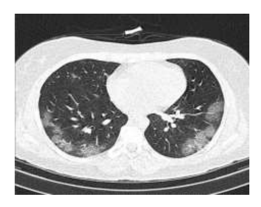
Figure 2. A 56-year-old female with complaint of fever and dyspnea and ground-glass opacities in both lungs.