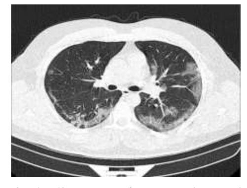
Figure 3. A 62-year-old female patients with chief complaint of dyspnea, fever, and cough showing bilateral ground-glass opacities in chest CT.