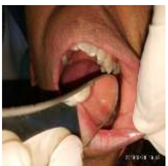
Fig 3: Fallow up 1 year after and remission of papillomatosis and pigmentation appearance.