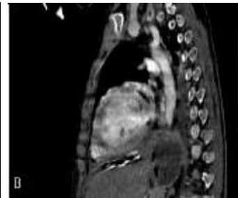
Figure 2. Contrast enhanced chest computed tomography (CT) scan of patient after pericardial catheter and right sided chest tube insertion. Pneumopericardium, right sided pneumothorax as well as bilateral mild pleural effusion and collapse consolidation are evident. A: Axial view. B: Parasagittal view.

Laboratory test results are shown in table 1. According to table 1, the patient's white blood (WBC) cells and platelet counts increased from the beginning of symptoms until the last day. Other results such as prothrombin time (PT) and partial thromboplastin time (PTT) were normal or slightly elevated (non-significant). Also, lactate de-hydrogenase (LDH) was 552 U/l in day 2 which increased to 920 in last day. Despite the surgical intervention, the Macklin phenomenon was not preventable in this patient. Eventually, the patient expressed cardiopulmonary arrest on the third day and unfortunately expired with no identifiable cause.